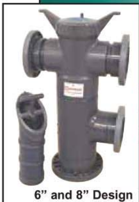
6" and 8" Design